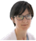
S. Carrara Milano (Italy)