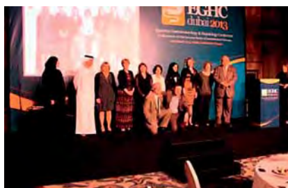
ESGE, ESGENA faculty and representatives, at the presentation during the gala dinner.