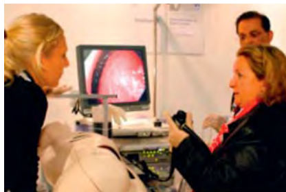
Experimenting with Hand-on training on biological models.

yourself. Different types of hands-on sessions are being offered throughout the week. Be sure to bookmark the activities you are most interested in.