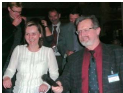
Symposium dinner: the polish fraction giving their best.

Attendees from 47 countries enjoyed lectures, debates and case presentations from senior experts and from the promising upcoming younger generation.