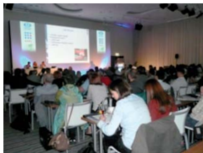
Full house in Berlin

The positive feedback received from participants at the recently held second of the Quality in Endoscopy Symposia has been exceptional.