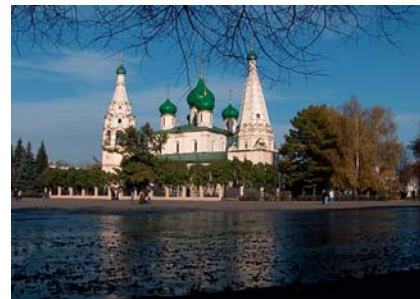
Early spring in Yaroslavl.

Please visit www.esge.com for further information.