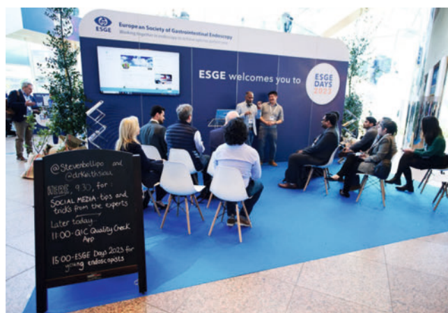
► Fig. 2 Social Media Workshop at ESGE Days 2023.

The authors declare that they have no conflict of interest.