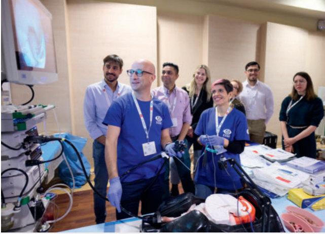
► Fig. 4 Hands-on training during ESGE Days 2024 – Practical demonstrations.

These workshops are a clear example of the increased collaboration between ESGE and ESGENA to promote working in teams.