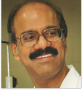
Dr Nageshwar D. Reddy