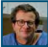
T. Ponchon Lyon (France)