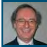
G. Costamagna Roma (Italy)