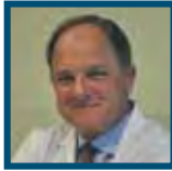
A. Malesci Milano (Italy)